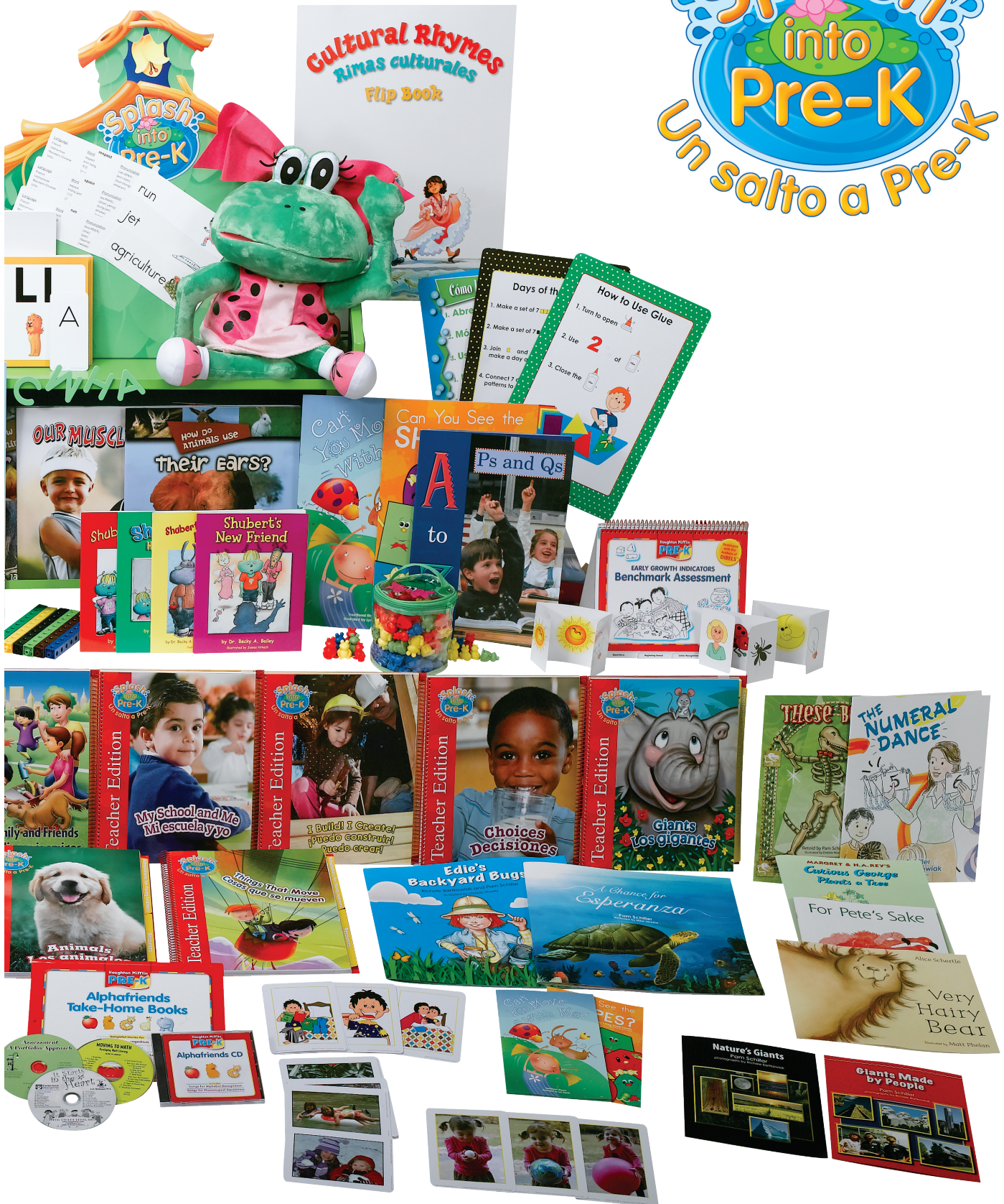
Splash into Pre-K/Un salto a Pre-K is an enhanced version of Frog Street Pre-K.